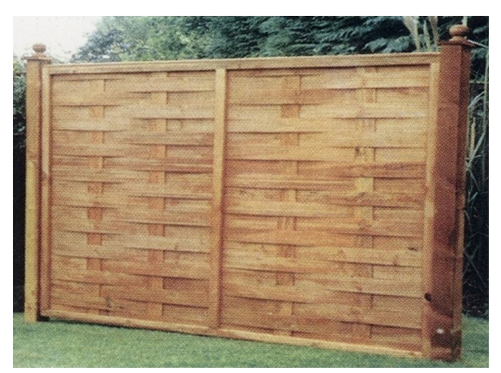
No diagonal fencing: