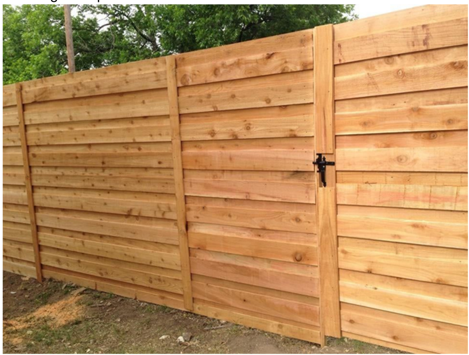
The "basket-weaving" style shall not be used, as in the following examples:

The board-over-board style shall not be used in the horizontal fence construction, like in the following example: